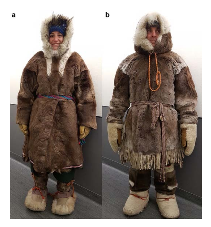
FIG. 1. Subjects wearing the two caribou-skin outfits. Subject 1 (a). Subject 2 (b). Each subject was similar in gender, height, weight, and body form to the individual for whom the outfit was made.